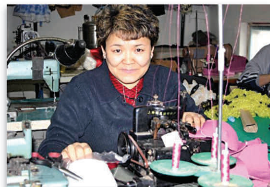
FINCA Kyrgyzstan Client

As 2011 draws to a close, we hope you'll take time to consider all of the powerful and convenient ways you can support FINCA's work to provide hope and opportunity for hundreds of thousands of hard-working microentrepreneurs throughout FINCA's 21-country network.