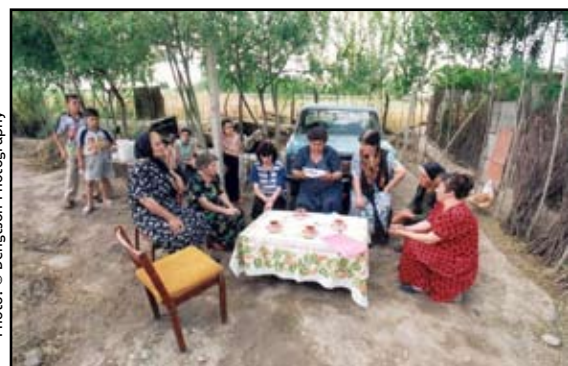
FINCA Azerbaijan clients reap the benefits of the program's outstanding products and services. non-bank credit organization in the nation, with nearly 700 employees working hard to provide loans to over 82,000 clients.