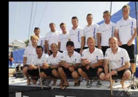
Team Delta Lloyd