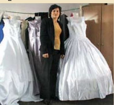
FINCA Kosovo Wedding Dress Vendor

Banking client in your honor? It's a simple, easy and tax deductible way for your loved ones to show their support for your dedication to FINCA's work, while providing a gift that continues to give into perpetuity. You can't say that about many gifts!