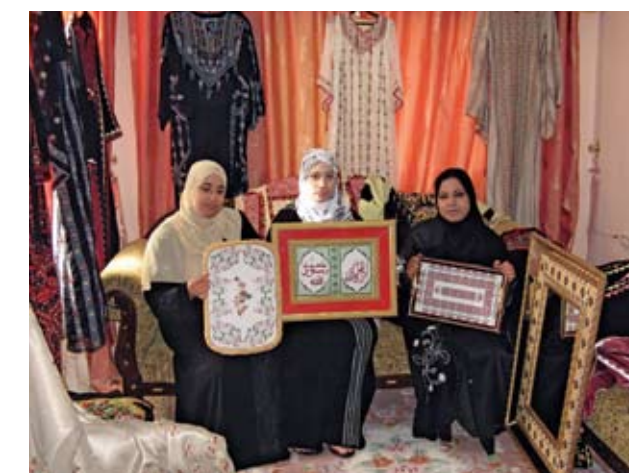
FINCA Jordan clients