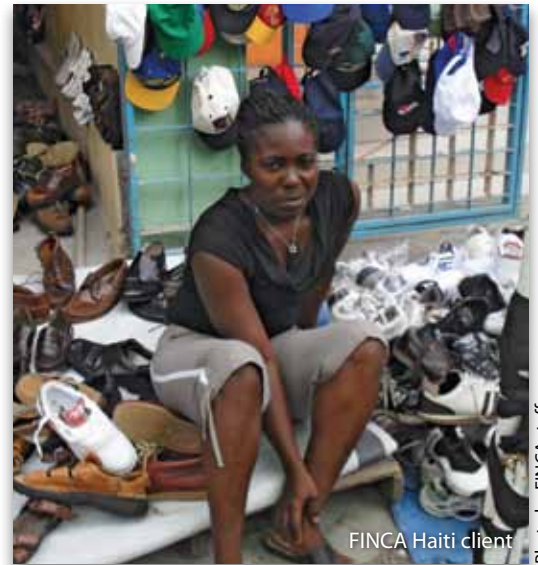
FINCA Haiti client