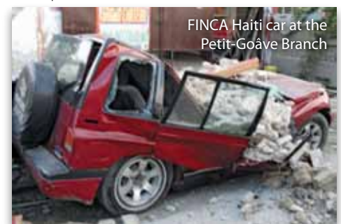
FINCA Haiti car at the Petit-Goâve Branch