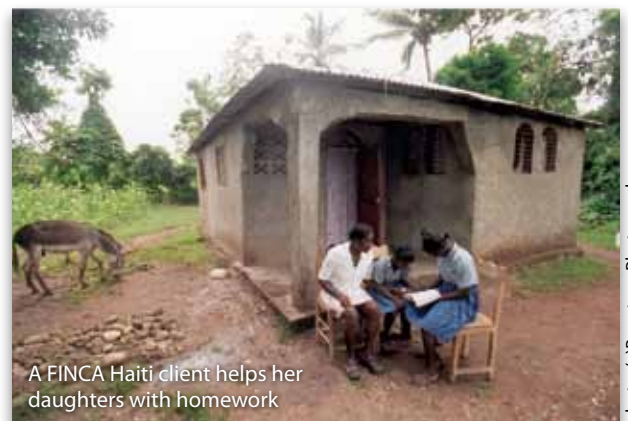
A FINCA Haiti client helps her daughters with homework