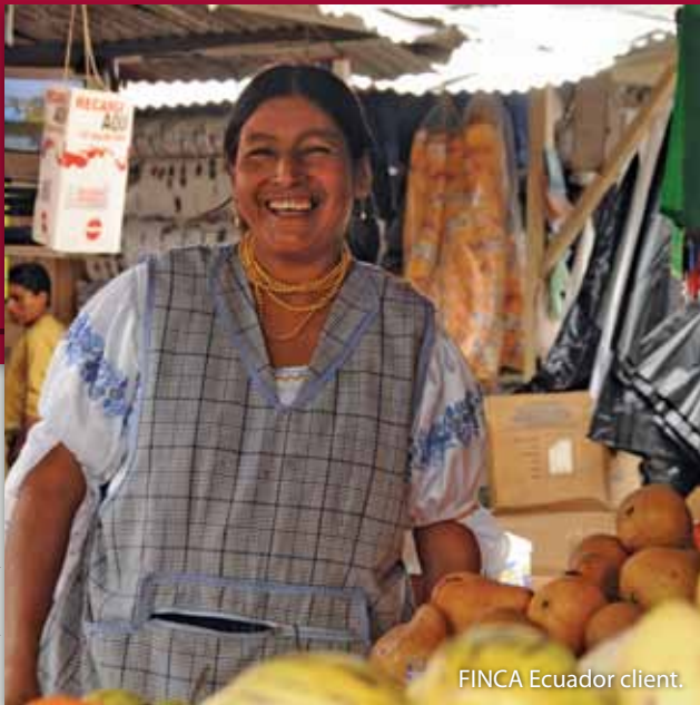
FINCA Ecuador client.