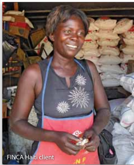
FINCA Haiti client